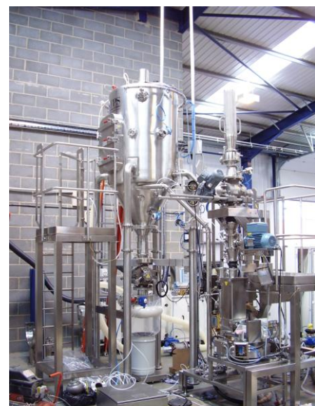
Brands & Trademarks: British Rema, Edgar Allen, Edgar Allen Aerex, Stag, Aerosplit, Microsplit